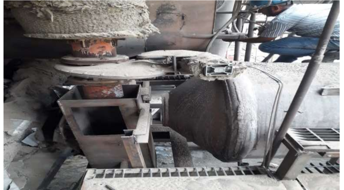
Existing CFB Boiler Rotary Ash cooler System Inlet